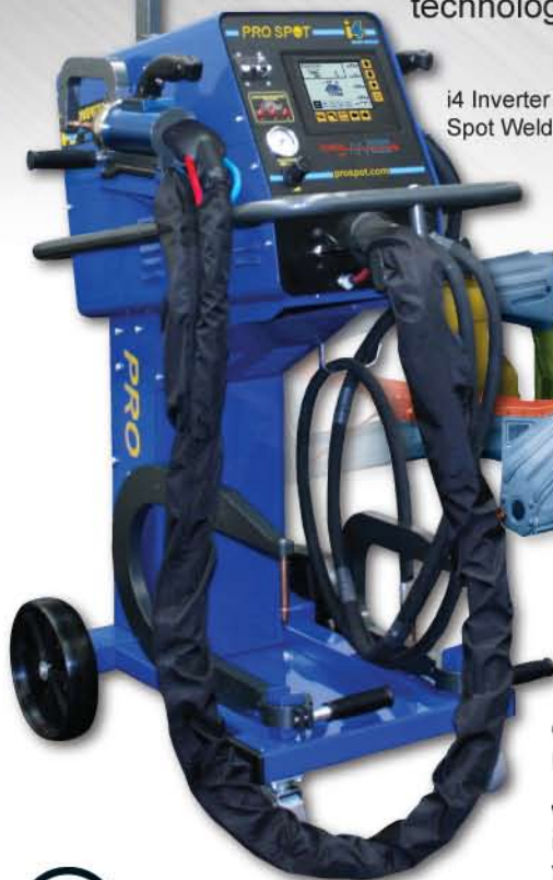
i4 Inverter Resistance Spot Welder

The i4 Inverter Resistance Spot Welder is designed to handle the difficult-to-weld materials such as boron steels and advanced high strength alloys (AHSS). These new metals are rapidly becoming the material of choice among car manufacturers and our technology is ready to meet their demands.